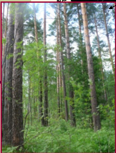
Pine forests on the terrace