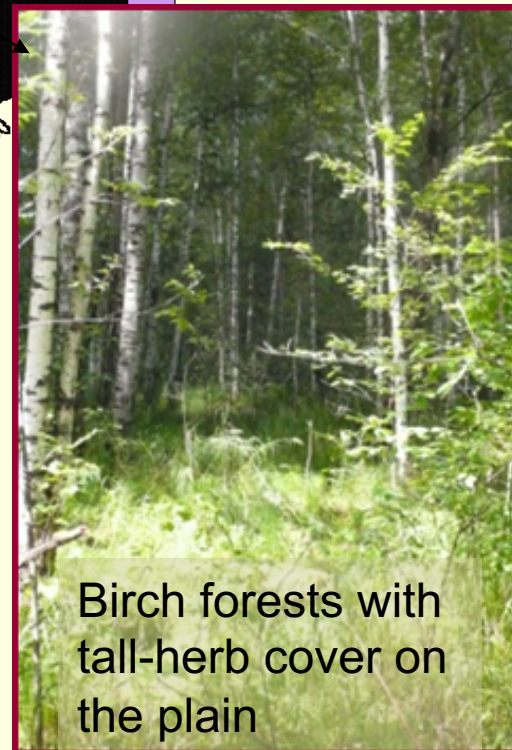
Birch forests with tall-herb cover on the plain