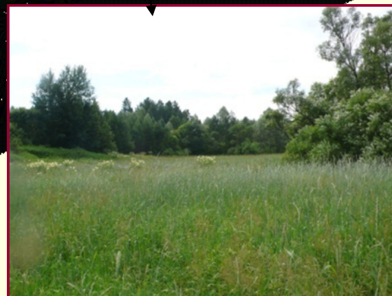
herb-grass meadow in the valley of Kireeva